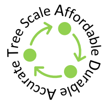
SPS 35 & 75